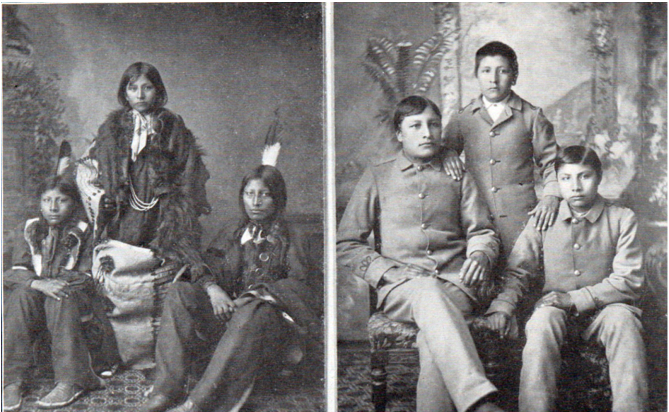
Carlisle Students, Before and After

The school at Carlisle is an attempt on the part of the government to do this. Carlisle has always planted treason to the tribe and loyalty to the nation at large. It has preached against colonizing Indians, and in favor of individualizing them. It has demanded for them the same multiplicity of chances which all others in the country enjoy. Carlisle fills young Indians with the spirit of loyalty to the stars and stripes, and then moves them out into our communities to show by their conduct and ability that the Indian is no different from the white or the colored, that he has the inalienable right to liberty and opportunity that the white and the negro have.