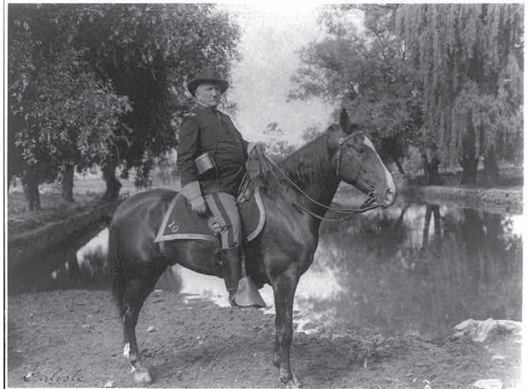
Col. Richard Pratt

It is a sad day for the Indians when they fall under the assaults of our troops...but a far sadder day is it for them when they fall under the baneful influences of a treaty agreement with the United States whereby they are to receive large annuities, and to be protected on reservations, and held apart from all association with the best of our civilization. The destruction is not so speedy, but it is far more general.