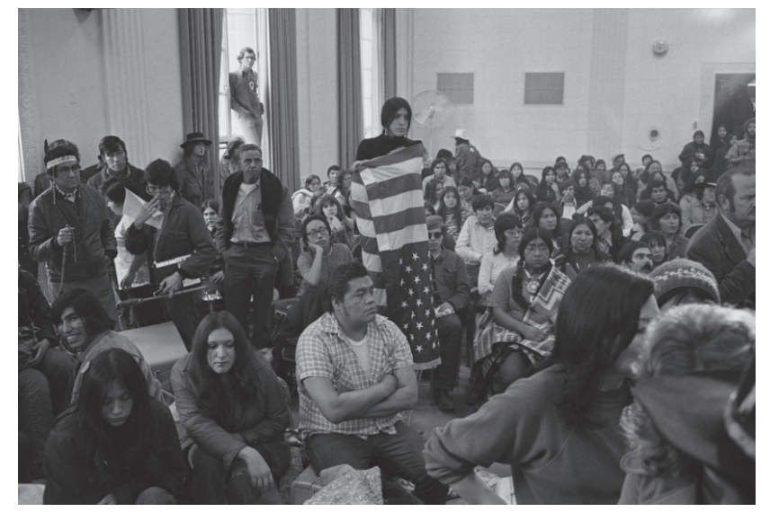
Native Americans Occupy BIA Offices

20. HEALTH, HOUSING, EMPLOYMENT, ECONOMIC DEVELOPMENT, AND EDUCATION