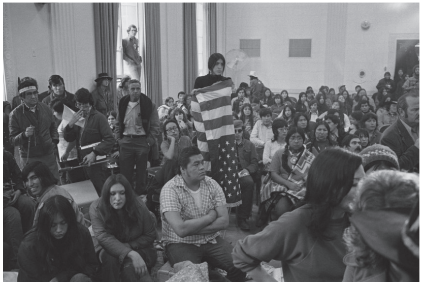
Native Americans Occupy BIA Offices