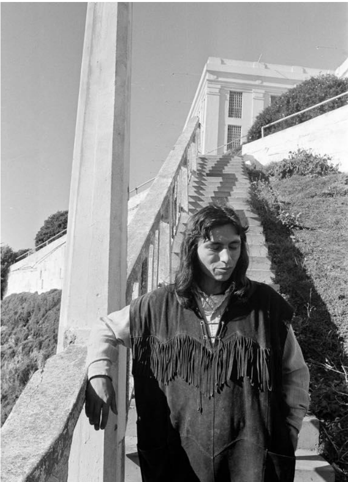
American Indian Movement member John Trudell at Alcatraz

From November 1969 to June 1971, Native Americans took over and claimed Alcatraz Island off of the coast of San Francisco as Indian Land. To announce their motivations for the occupation, they authored the following proclamation: