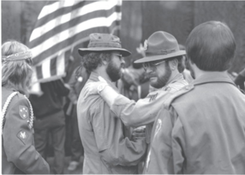
This scene caught my eye immediately, and still demands strong emotional response. It appears that these two were comrades in Vietnam and just became reacquainted at the Wall.

dedication. I found an open area near the monument set aside for Gold Star families.