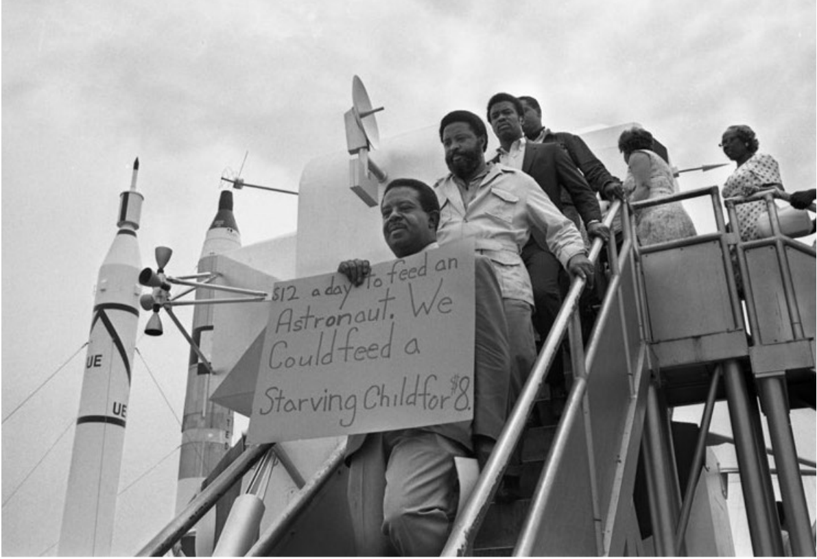
Image 3: Group protesting the Apollo 11 mission at NASA's Kennedy Space Center