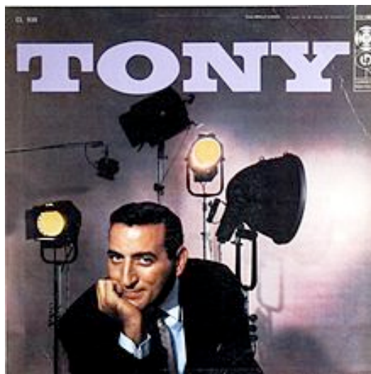
Album cover, 1957