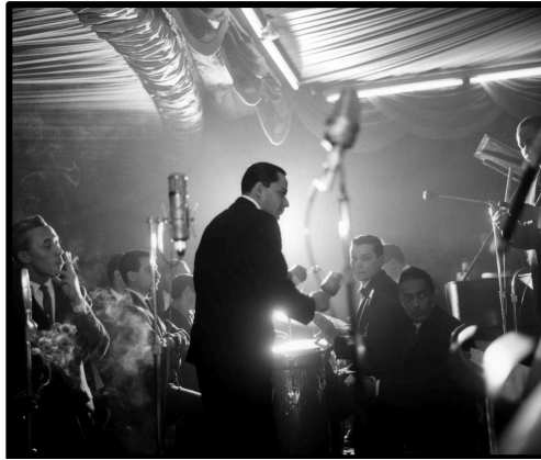
Tito Rodriguez at the Palladium