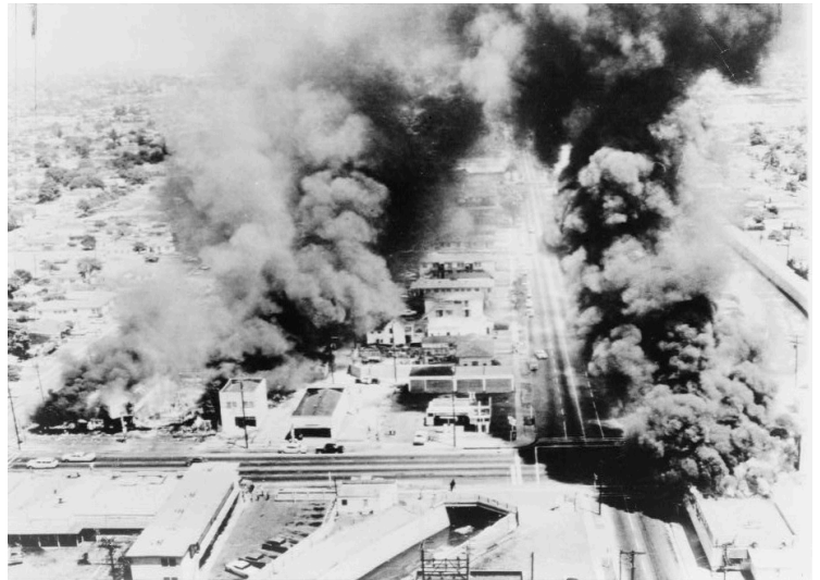
The Watts neighborhood of Los Angeles burning after riots, 1965