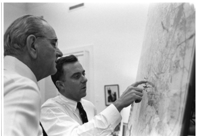
President Lyndon B. Johnson and Joe Califano chart the riot outbreaks in Washington, DC.