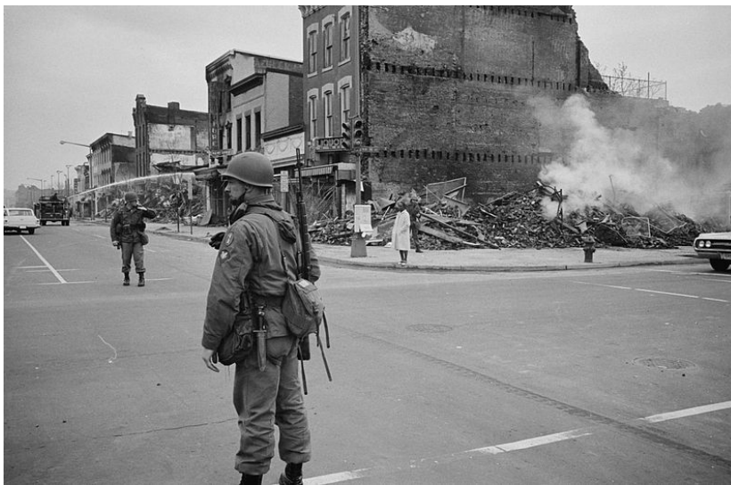
Army troops called in to Washington D.C. to keep the peace after riots