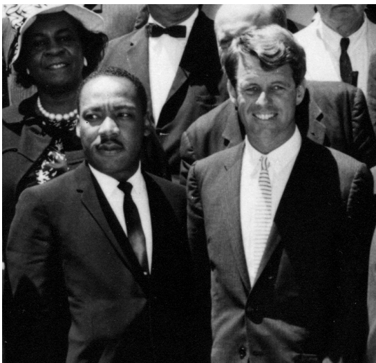
Dr. King and Kennedy in Washington D.C., 1963

Watch Video of Sen. Robert F. Kennedy on the Merv Griffin Show in 1967