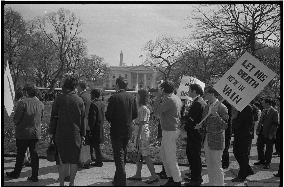
Protests outside the White House following King's Assassination