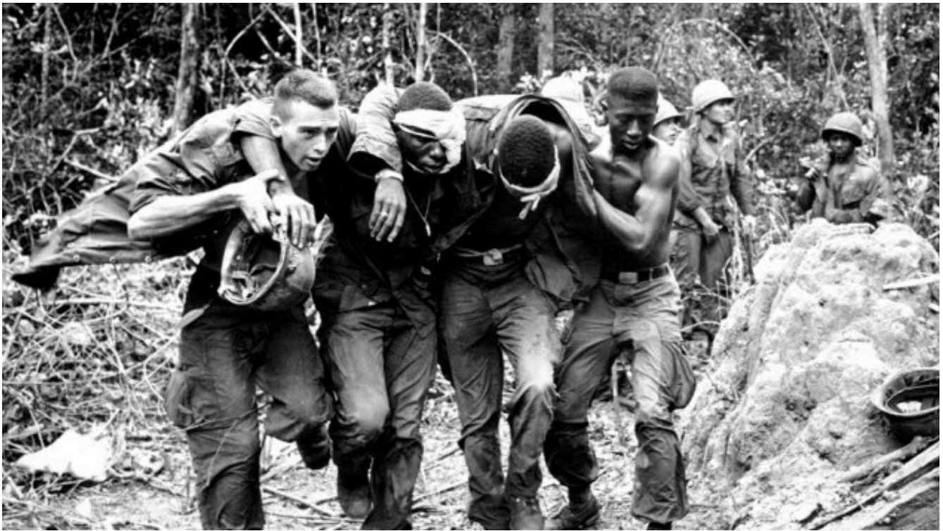
Wounded U.S. paratroopers are helped by fellow African-American soldiers to a medical evacuation helicopter on Oct. 5, 1965 in Vietnam.

National Archives, Statistical Information about Fatal Casualties of the Vietnam War