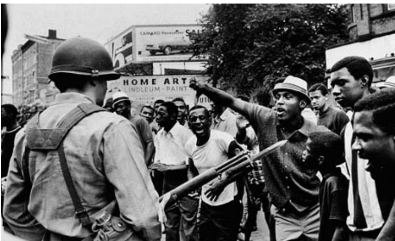
A standoff with police during the Newark riots, 1967