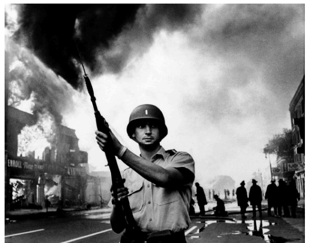
A national guardsman during Detroit riots, 1967