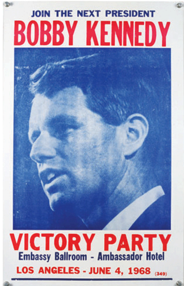
Kennedy speaking at a Civil Rights rally in 1963 and a Campaign Poster for the very evening he was shot in 1968